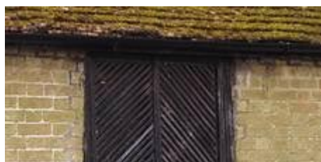
333 High Street