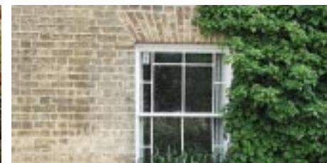
29 High Street