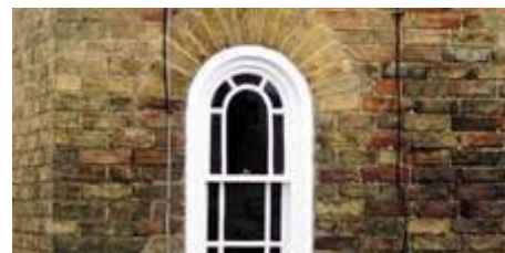
140 High Street