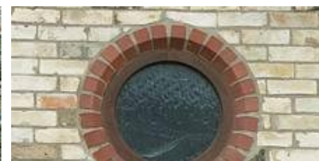
8 Margett Street