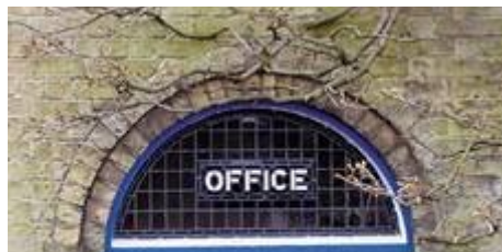
220 High Street