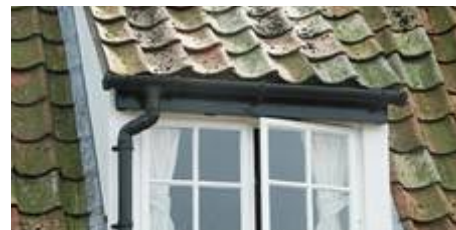
44 Corbett Street