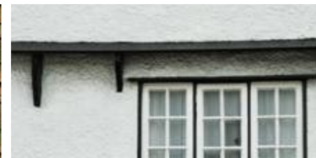
11 High Street